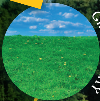
GRASS & HAY