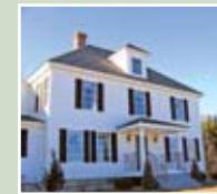
Collyer Brook Farm